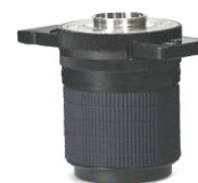
35mm HD Quartz Lens

The ST-2999EMRUV Forensics realtime fingerprint imaging system takes the fingerprint on the irregular surface easily and fast.